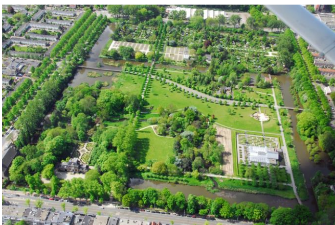
Aerial view of Park Frankendael, Amsterdam

The end product of this study was the creation of a value case for Park Frankendael which highlights key quantitative, qualitative, monetised and non-financial insights into the multiple ecosystem services that are currently being provided by the park to the city and its residents. Future applications of the i-Tree Eco tool in urban projects with natural ecosystem elements can further strengthen the value case for urban NBS and promote their inclusion into urban planning and decision-making.